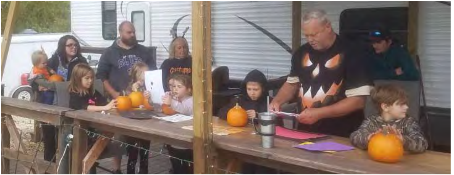
The Pleasant Hill kids decorating pumpkins and showing off their costumes.